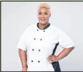
Heritage & Soul Dinner 6:00 p.m. Tickets $25