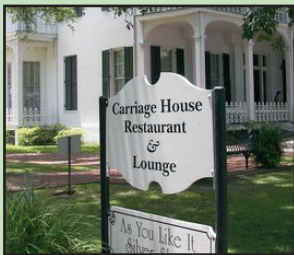
Lunch at The Carriage House 11:30 a.m. Tickets $30