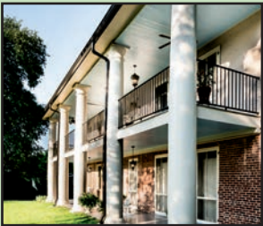
Tour of Concord Quarters 4:30 p.m. Tickets $15