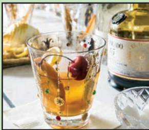
Cocktail Party at Regina's 4:00 p.m. Tickets $15

The Natchez Literary and Cinema Celebration in conjunction with Natchez Festival of Music and Mississippi School of Folk Arts presents